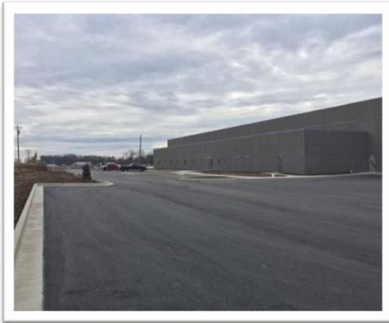
Exterior: Parking and Main Entrance

Banner Medical's Greenfield facility in Warsaw, IN is taking shape. Since commencing construction in August, 2015, the 43,000 square foot facility is now fully enclosed and under roof. All public utilities and services are in place. Key milestones such as paving, flooring, framing, electrical, and plumbing have been reached. Banner Warsaw is expected to be completed and operational in the second quarter of 2016. The following provides images of the facility in progress.