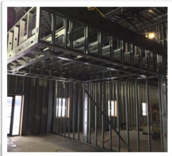
Front Entrance: Main Lobby