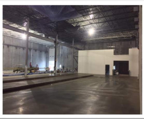
Production Area: Metal Processing